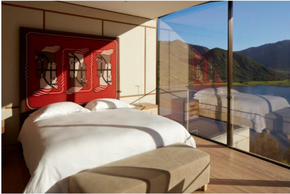
The H Suite features an unexpected side table made using an Hermès saddle, upholstered walls with leather piping, and exquisite Dennison floors.